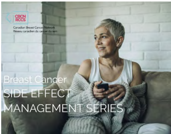
Breast Cancer: Side effect management Series www.cbcn.ca/publications-and-resources#side-effect-management-series