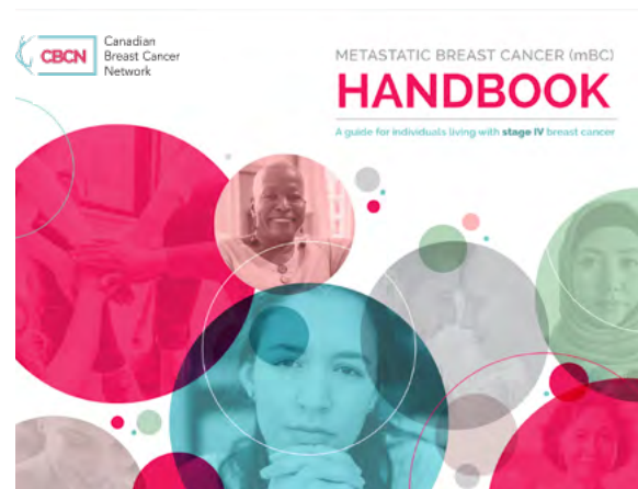
Metastatic Breast Cancer Handbook: A guide for individuals living with stage IV breast cancer