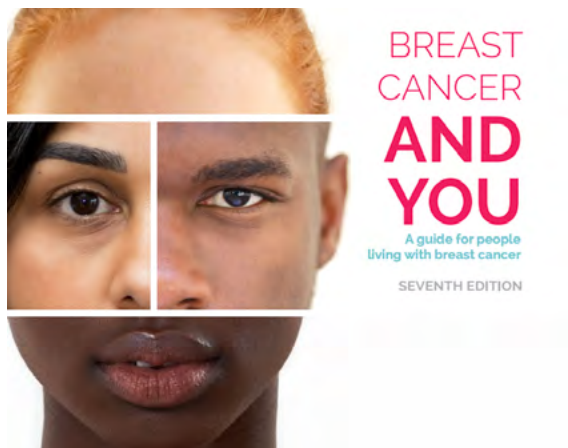
Breast Cancer and You: A guide for people living with breast cancer, Seventh Edition