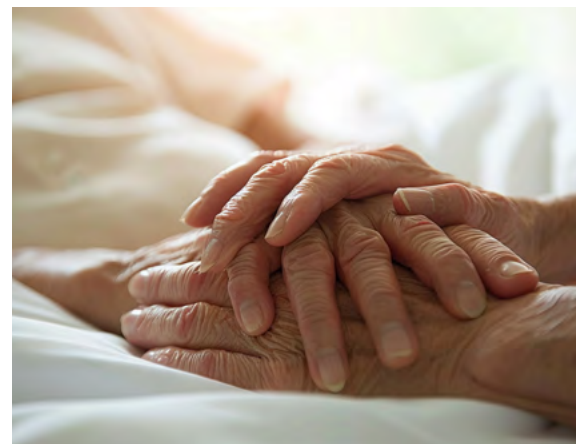
End of Life Care www.cbcn.ca/mbc_end_of_life