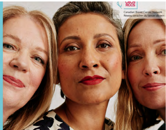
Advocacy Guide: Palliative care in Canada www.cbcn.ca/advocacy-guides#advocacy-guide-palliative-care-Canada