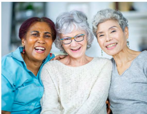
Senior Women with Breast Cancer