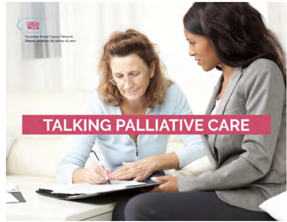
Breast Cancer: Talking palliative care www.cbcn.ca/publications-and-resources#talking-palliative-care